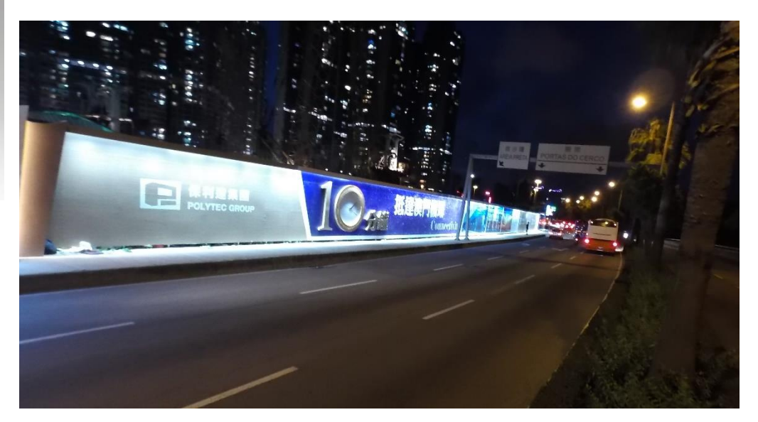
DHS Lighting (Asia) offers fecade design with professional wall washer lighting solution. Our DMX, Art-net control system provides your viewers to experience energetic mood of our design.